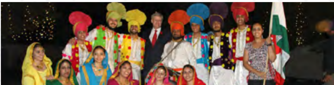
PHOTO: Former Prime Minister of Canada, Hon. Stephen Harper, with FVI students FVI, Chandigarh